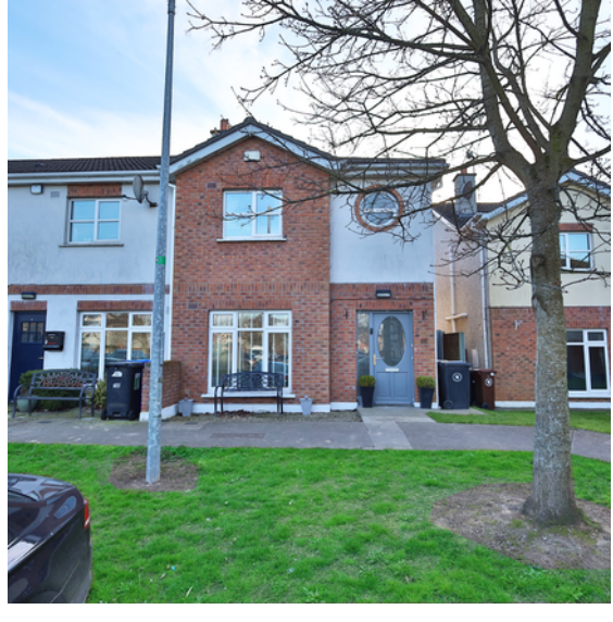
98 Bru Na Habhainn, Navan