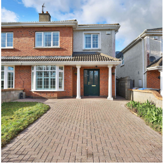
7 The Place, Glenveigh, Navan