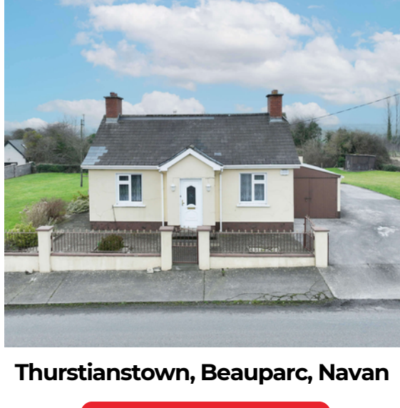
Thurstianstown, Beauparc, Navan