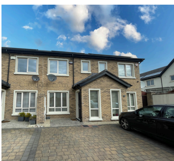
16 Cois Glaisin Court, Johnstown, Navan