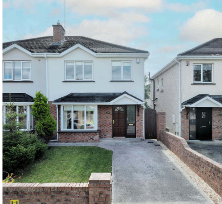
126 Oak Crescent, Bailis Downs, Navan