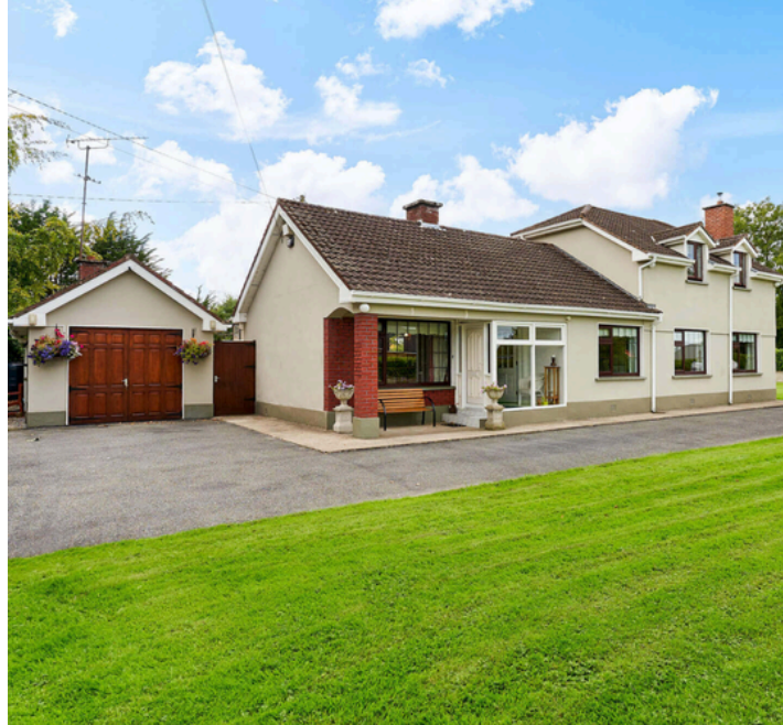
Dufflands, Commons Lane, Navan