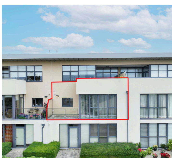
27 Knightsbridge Court, Knightsbridge Avenue, Trim