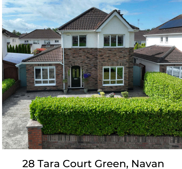
28 Tara Court Green, Navan