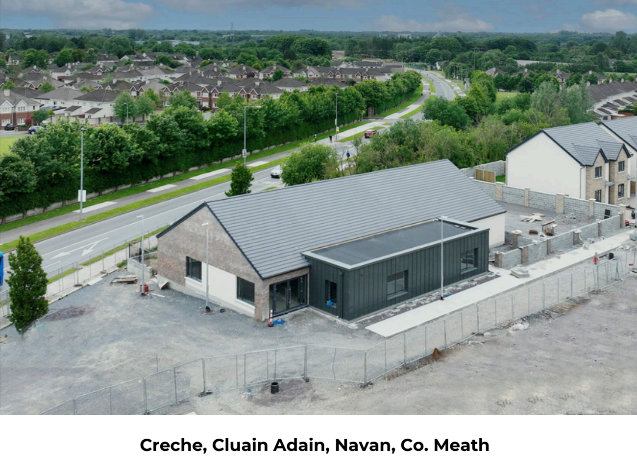
Creche, Cluain Adain, Navan, Co. Meath