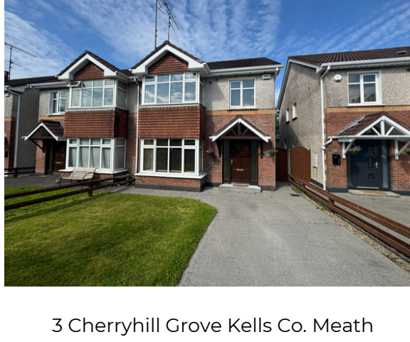
3 Cherryhill Grove Kells Co. Meath