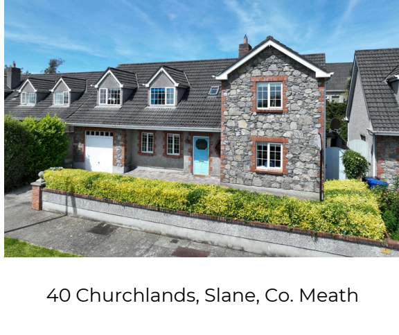
40 Churchlands, Slane, Co. Meath