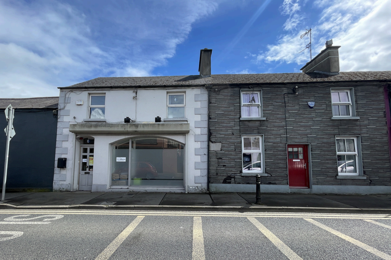
1 Brews Hill, Navan, Co. Meath