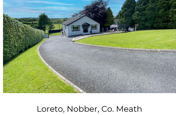
Loreto, Nobber, Co. Meath