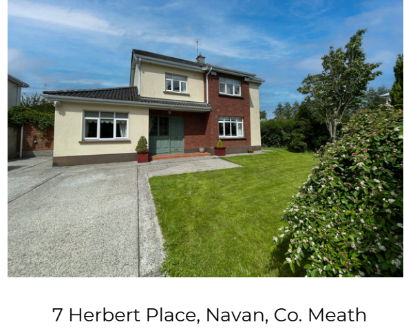
7 Herbert Place, Navan, Co. Meath