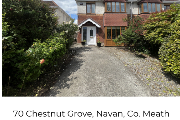
70 Chestnut Grove, Navan, Co. Meath