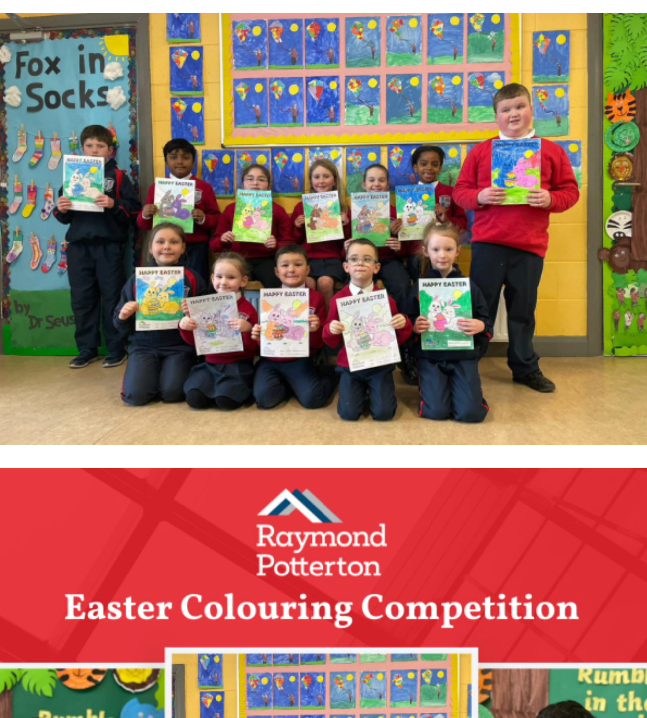
Bective, Kilmessan, Co. Meath