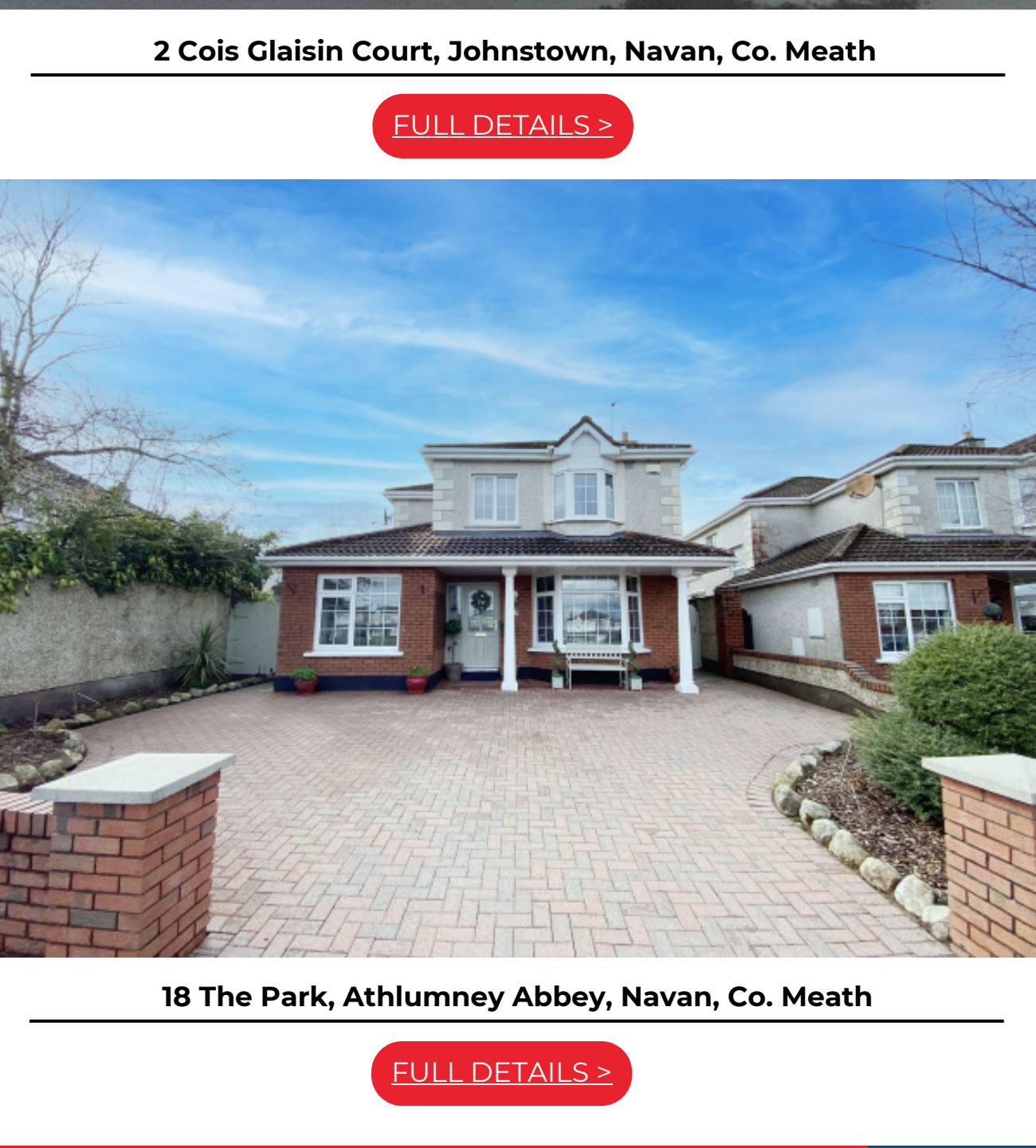
2 Cois Glaisin Court, Johnstown, Navan, Co. Meath