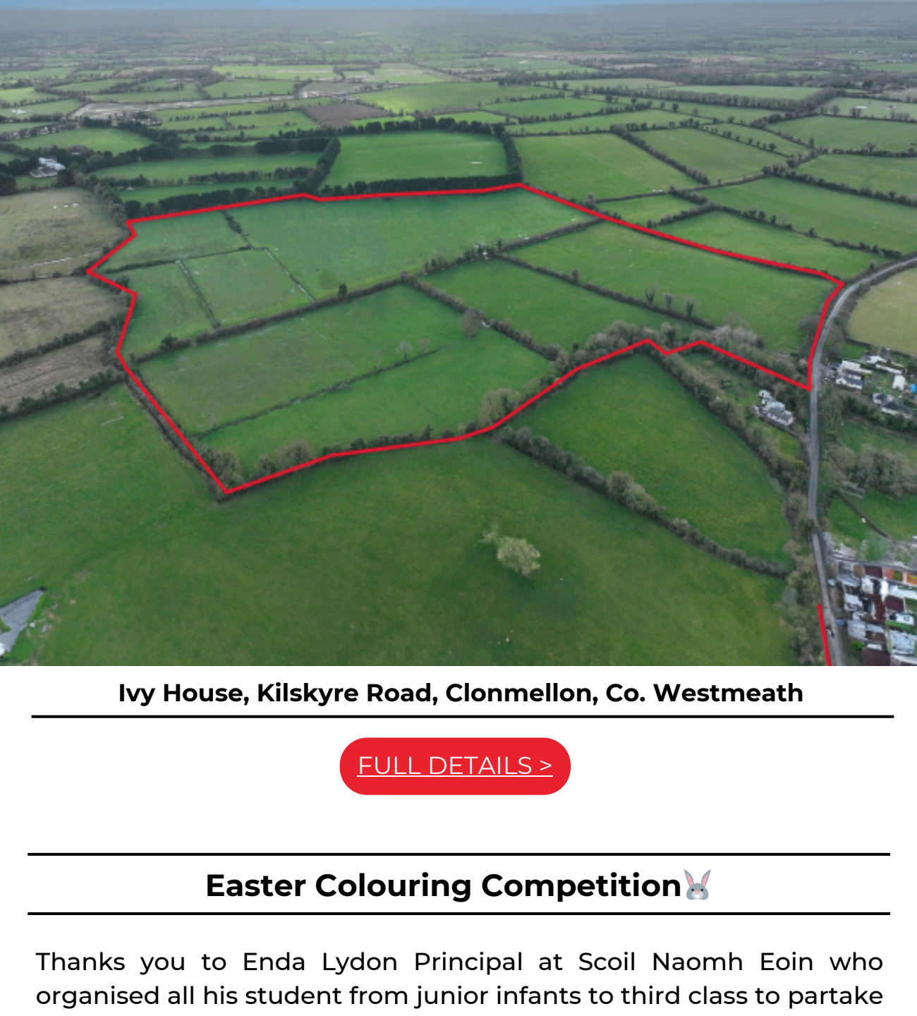
Ivy House, Kilskyre Road, Clonmellon, Co. Westmeath