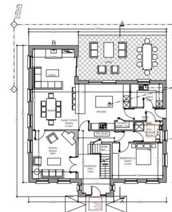
GROUND FLOOR PLAN scale 1:100 ground floor area: 125.4m 2 (1350sq ft) TOTAL AREA: 234.4m 2 (2523 sq ft)